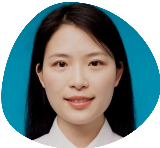
Dr Dongmei Tong

Use cutting-edge spatial genomics and advanced imaging approaches to characterise the tumour microenvironment of non-small cell lung cancer.